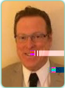
Precision BioSciences Inc., USA