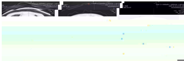
Figure 2 CT scan showed diffuse bilateral nodular lesions in lung parenchyma, associated with multiple mediastinal lymphadenomegaly, right lower lobe atelectasis, slight right and left pleural effusion.