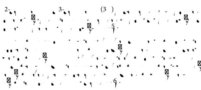
e Signi cance of Ethical Considerations