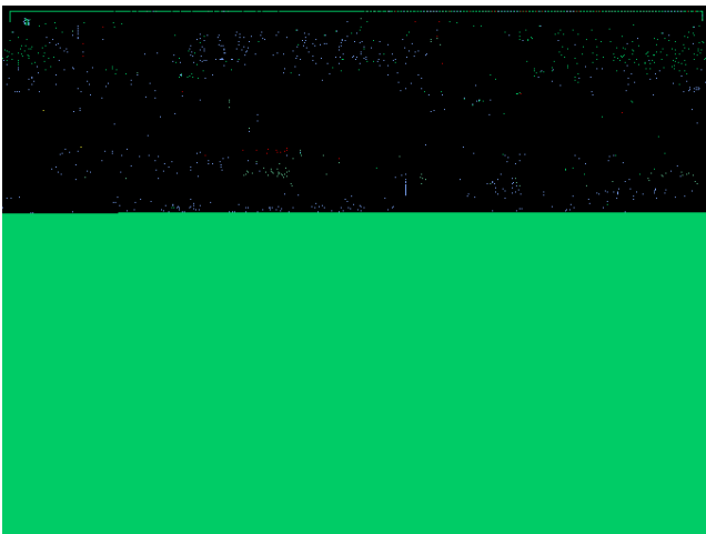
Figure 3 Biopsic fragments of tissue composed by spindle cells [Hematoxylin & Eosin stain; 4X]. G. Some fragments showed storiform pattern of growth [Hematoxylin & Eosin stain; 20X]. H: The spindle cells were positive for S100 [10X].