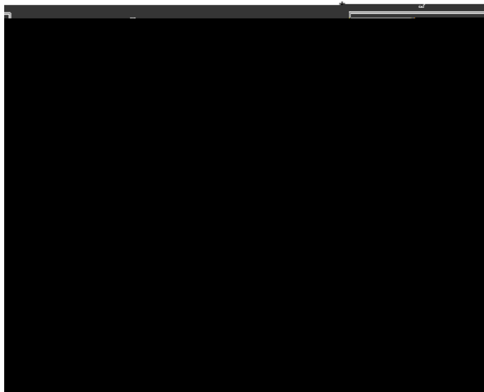
Figure SM2: Lactose prodigestive effect on of BAD lactase in absence of digestive enzymes. To assess the prodigestive activity of BAD towards lactose, a standard food, containing lactose as a carbohydrates source, was digested with an in vitro digestive process model, in absence of digestive enzymes. The carbohydrate hydrolytic activity of BAD supplemented lactase was determined by measuring the percentage (%) of release glucose compared to the expected one. SF: Standard Food; BAD: Biochetasi Acidità e Digestione. * p < 0.05 .